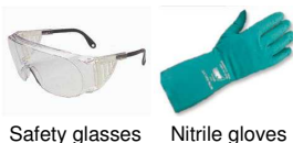
Safety glasses Nitrile gloves